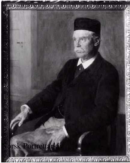
To the left a painting made by Erik Theodor Werenskiold (1855 - 1938) Dated 1898. Oil painting, 100 x 80