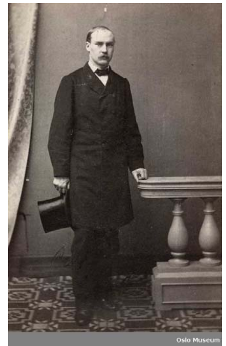
To the right: Fotografering Ca. 1865 OB.F03404D