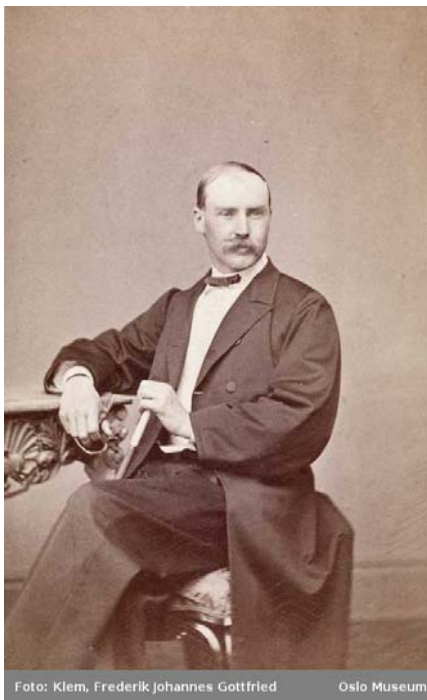
To the left: Fotografering Ca. 1880 Fotograf: Frederik Johannes Gottfried Klem. Oslo Museum OB.F03335D http://www.oslomuseum.no Digitalmuseum http://www.digitalmuseum.no/

Possible places for the original paintings: Rikshospitalet or in the family Norsk Portrettarkiv http://www.portrettarkiv.ra.no